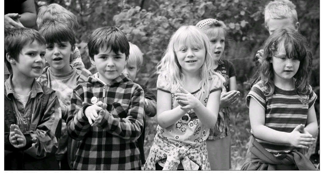
Students at Mill Village Consolidated School sang a special fish song before releasing their very tiny brook trout into the Medway River Monday, June 6.

River one by one, saying goodbye to the fish friends they became so fond of over the past few months.