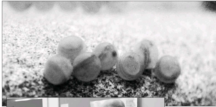
About 300 fish eggs, each smaller than a kernel of corn, were put in an aquarium in the school.